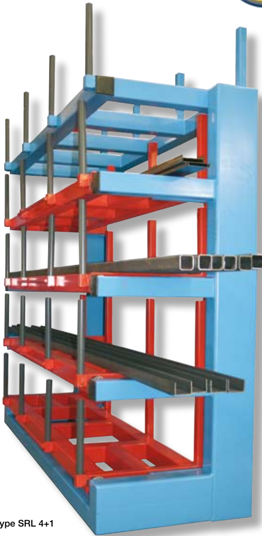
type SRL 4+1

Optional custom made measurements and other number of drawers possible! - Other RAL colors also available upon request.