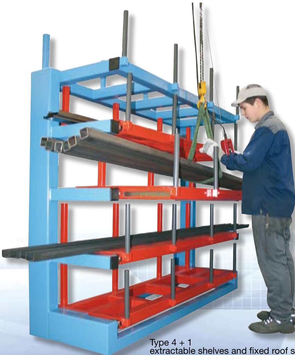
Type 4 + 1 extractable shelves and fixed roof shelf