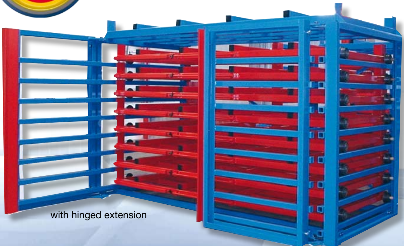
with hinged extension

Non-standard performances are standard for us