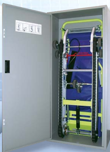
Steel cabinet for quick storing of the Evac Skate W x D x H: 508 x 279 x 1151 mm