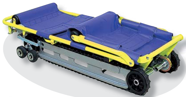
Easy to fold for space saving when not in use